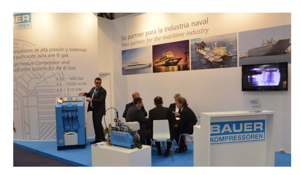
BAUER staff in an in-depth customer meeting