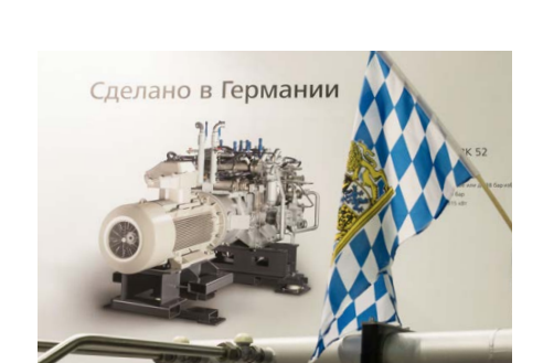
Made in Germany: quality under the Bavarian flag: the new BK 52 compressor block

The city of Vigo is situated in the extreme north-east of Spain. Europe's largest fishing port, it is the headquarters of the European Fisheries Control Agency and a major shipping centre – as well as home to the annual shipping exhibition 'Navalia'.