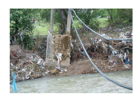
Widespread damage resulted from the worst flooding to hit the Balkans in 120 years

The staff collected enough donations to more than fill a large van, organised by the campaign; the van was packed to the roof before setting off for the crisisstruck region, and the donations that would not fit into the van were welcomed by charity collection points for the victims of the disaster.