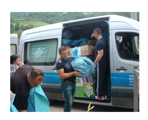
Full up! BAUER's donations team pack goods into the crammed BAUER van.

staff had already set up an initiative to collect donations of food, clothes and other items. The company management supported the campaign with a will, making a generous financial donation as well as providing assistance with logistics.